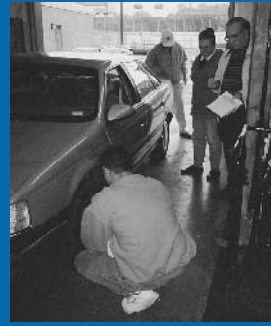
Third Annual Auto Inspection held October 2003, Wheaton

It is recommended that drivers carry a tire pressure gauge and check their tires on a regular basis or have them checked at the gas station each time they fill up. Underinflated tires do not wear well and do not provide the good traction, especially in winter driving.